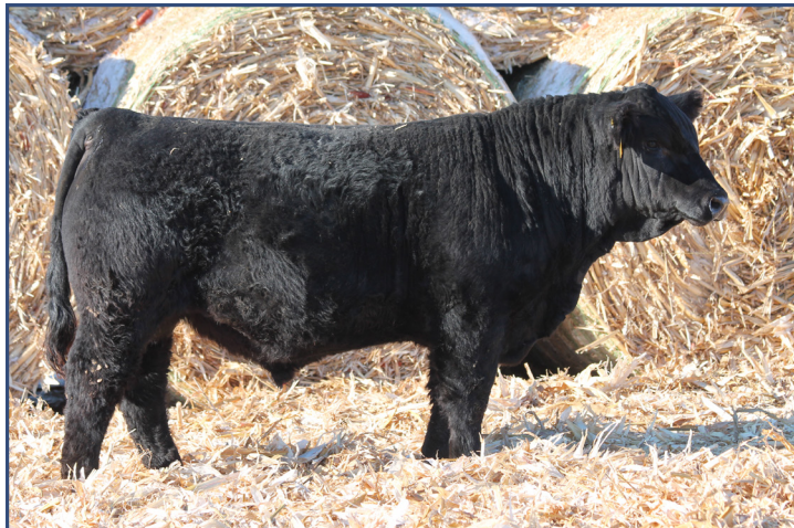
LOT 3 • SYS GENESIS M7