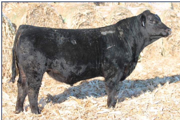
LOT 31 • SYS GOLD M81