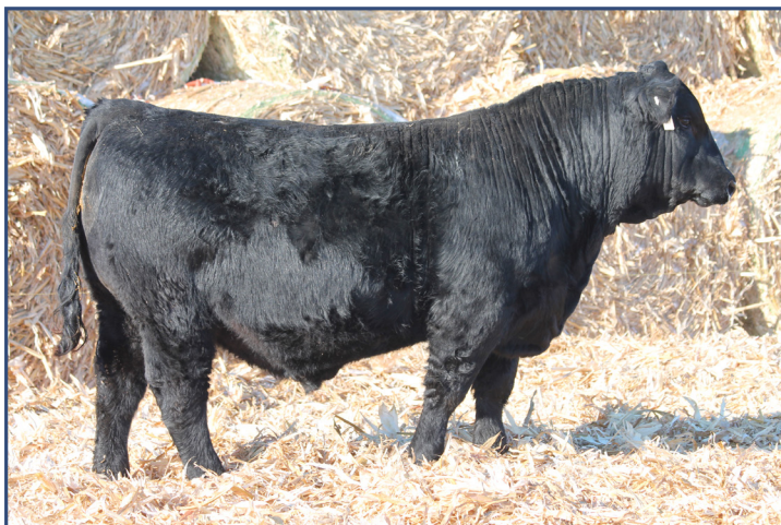
LOT 2 • SYS GENESIS M11