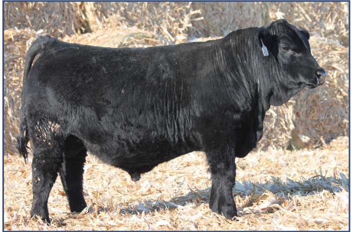
LOT 7 • SYS OUTLAW M21