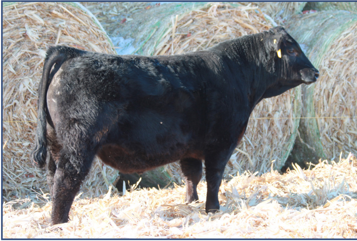
LOT 45 • SYS BOARDWALK M133