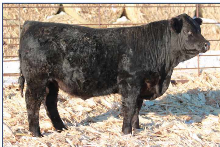
LOT 44 • SYS EMBLEM M60