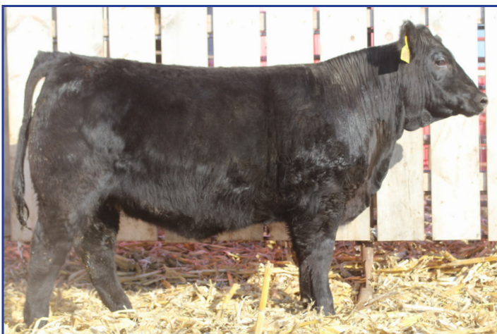
SYS MS DIPLOMAT F18 • DONOR DAM TO LOTS 1, 2, 5, 6, 7