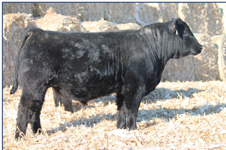
LOT 41 • SYS AVALANCHE M51