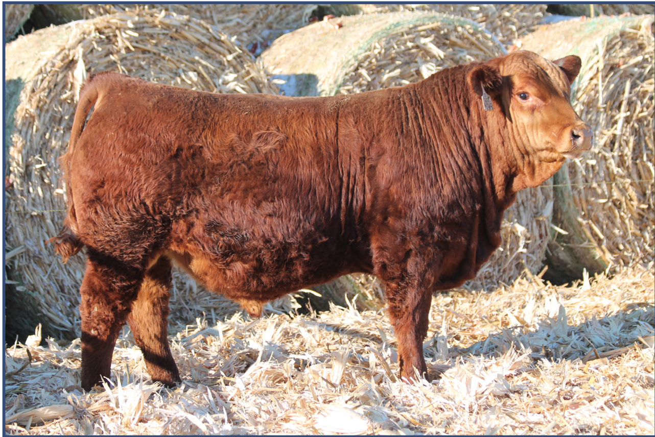
LOT 46 • SYS JACK DANIELS M149