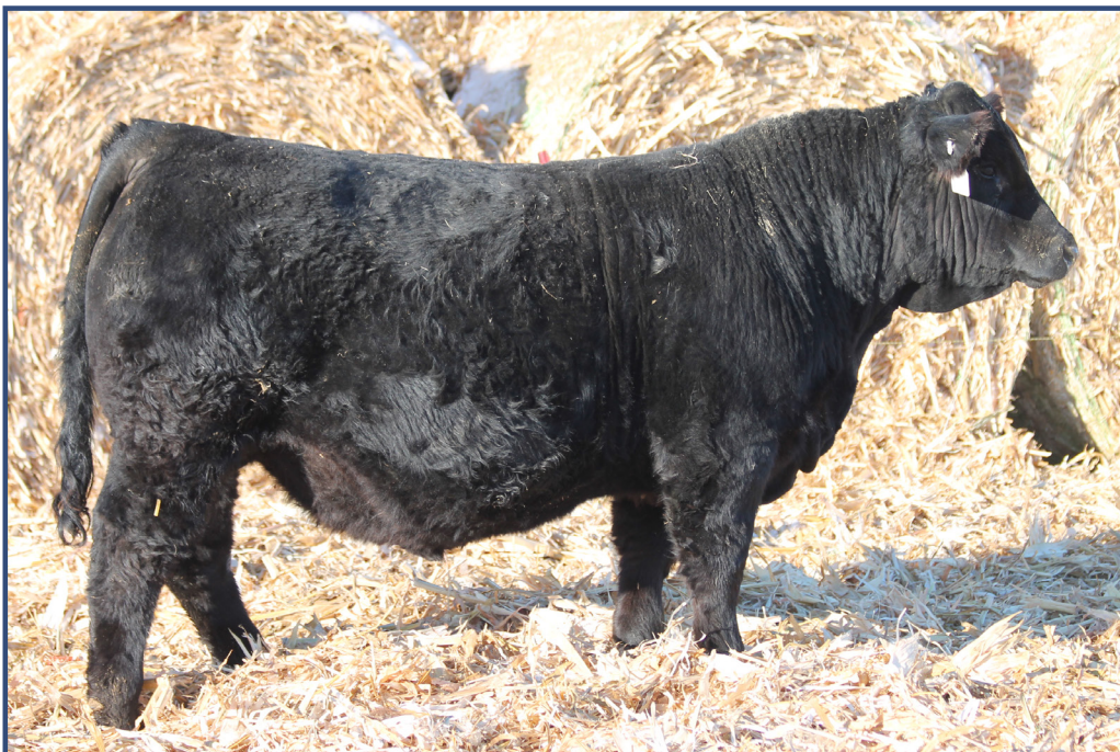
LOT 10 • SYS KROWN M50