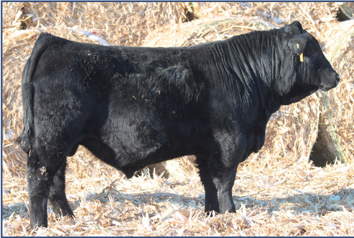
LOT 6 • SYS OUTLAW M34