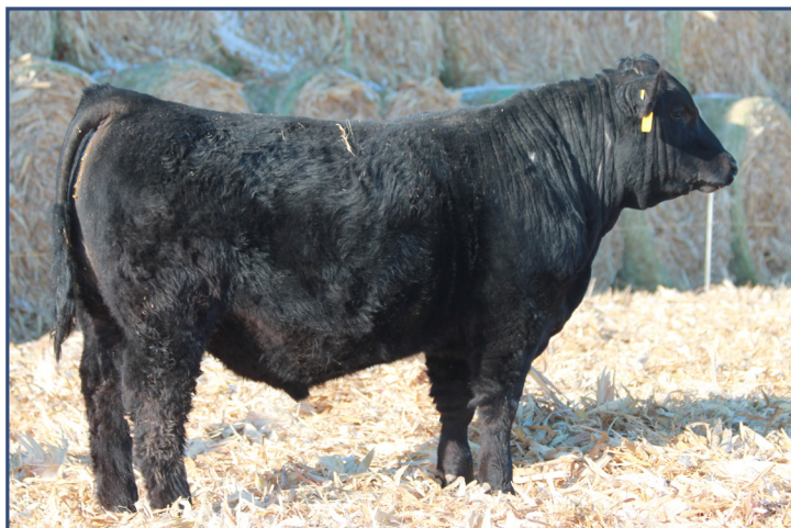
LOT 21 • SYS PROMINENT M165