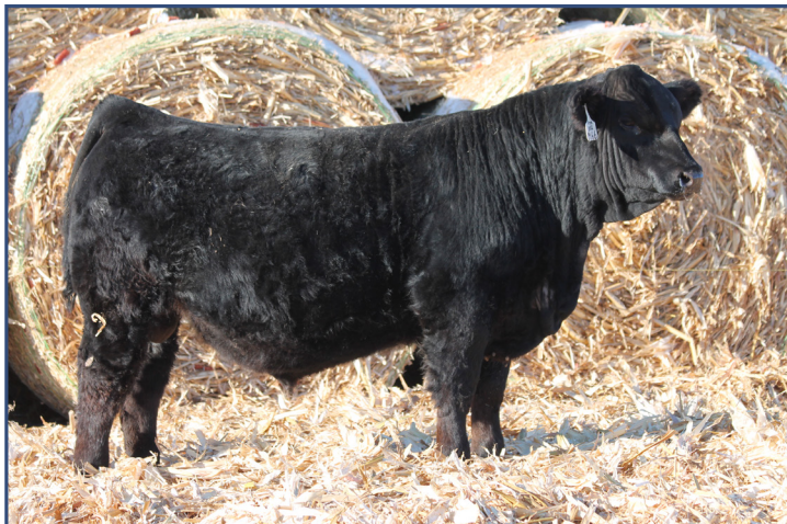
LOT 20 • SYS PROMINENT M66