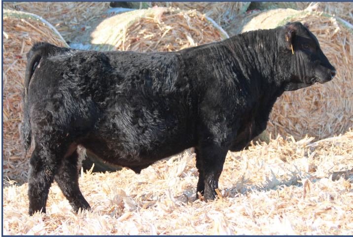
LOT 11 • SYS KROWN M61