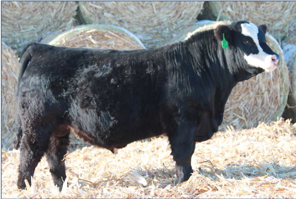
LOT 9 • SYS KROWN M64