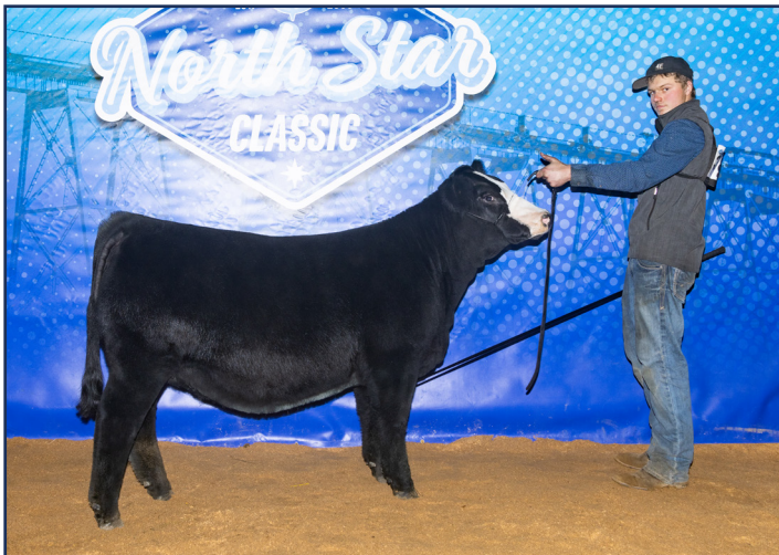
SYS HEAVEN IS FOR REAL M15 FULL SIB TO LOT 8 AND MATERNAL SIB TO LOT 9