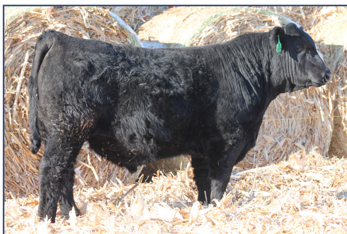
LOT 25 • SYS PROMINENT M107