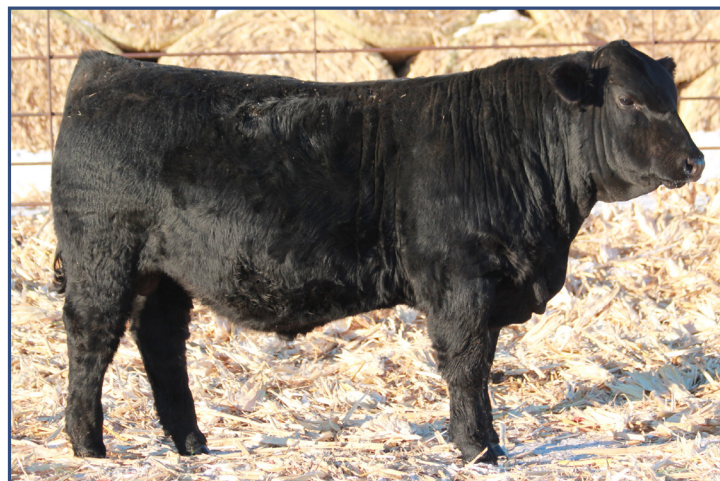
LOT 15 • SYS HONOR M124