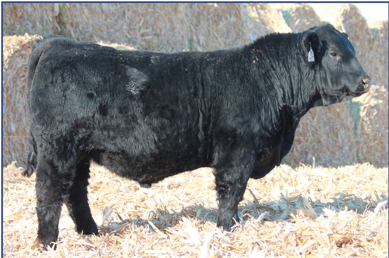
LOT 13 • SYS ADVANTAGE M57