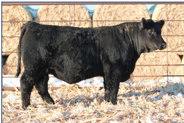
LOT 4 • SYS GENESIS M115