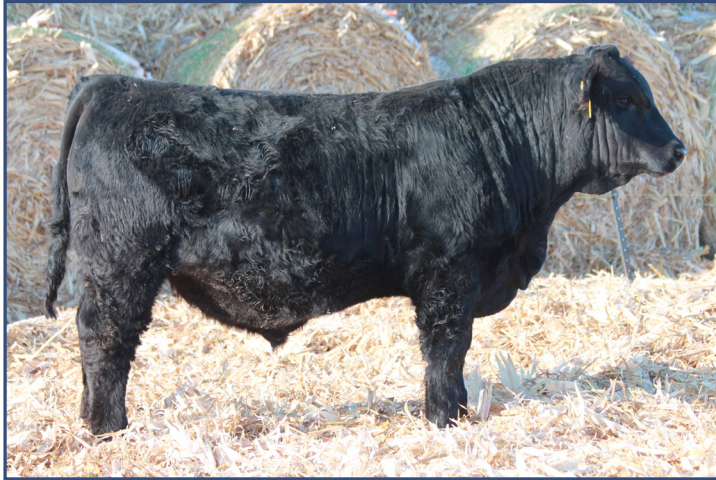
LOT 28 • SYS GOLD M125