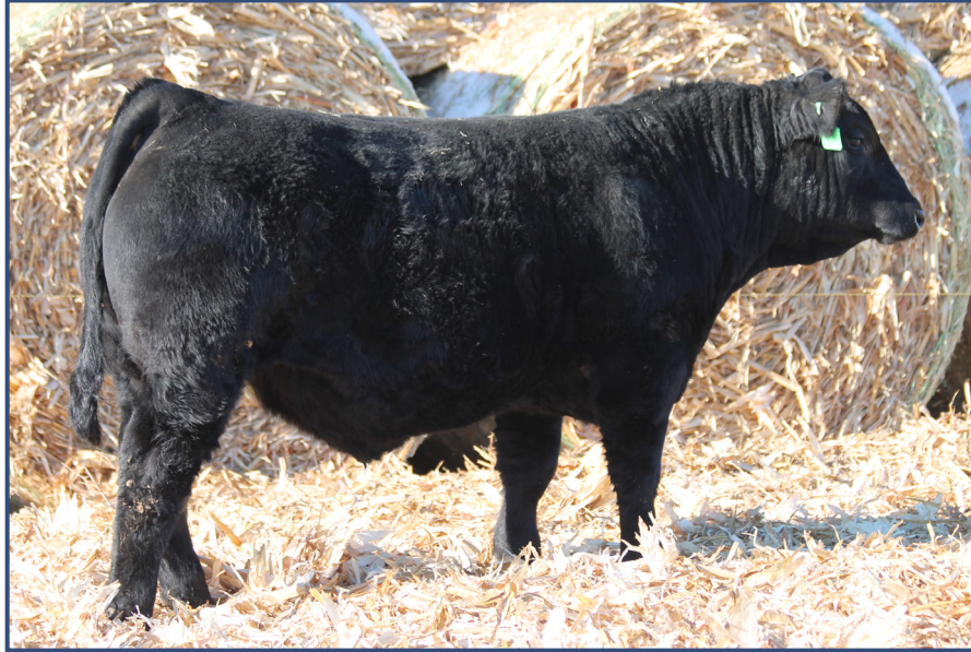
LOT 37 • SYS GUNSMOKE M52