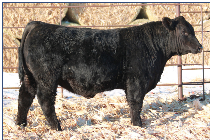
LOT 32 • SYS GOLD M140