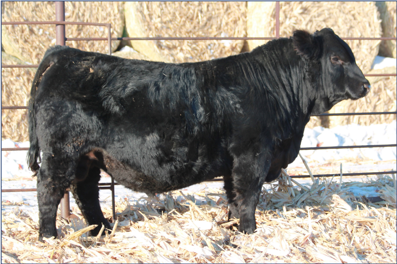
LOT 5 • SYS OUTLAW M25