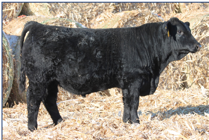
LOT 14 • SYS ADVANTAGE M137